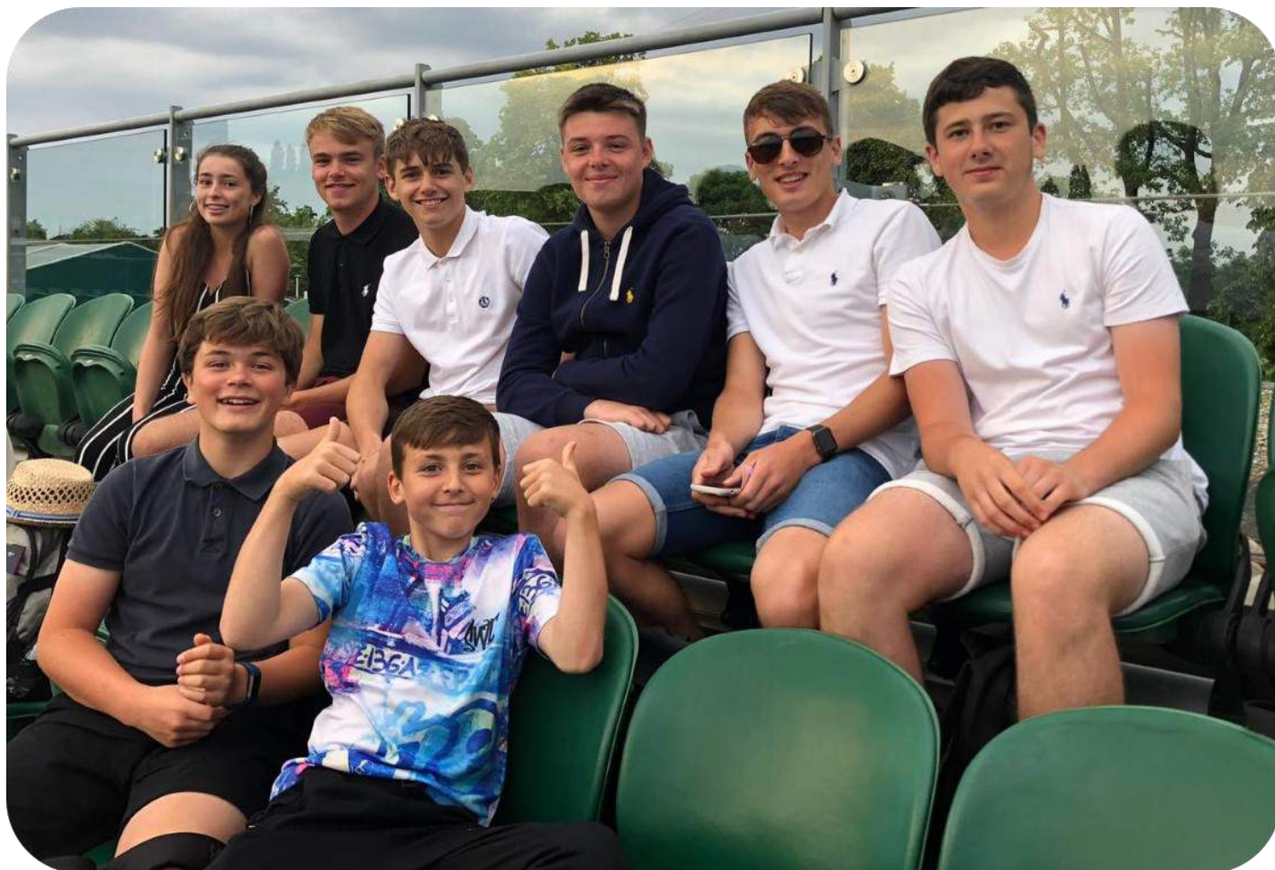
Another great sporting trip thoroughly enjoyed by all students!

Meanwhile on court 2 the students got to see out another 5-set thriller between Rojer/Tecau and Cabal/Farah with the game going to the latter pair 11-9 in the final set.